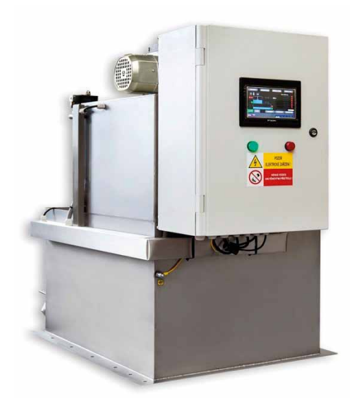
Automatic polymer station