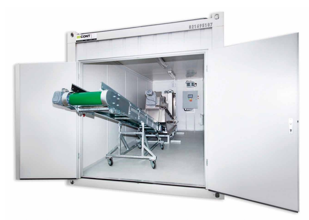
Built-in dewatering machine in the insulated container with belt conveyor