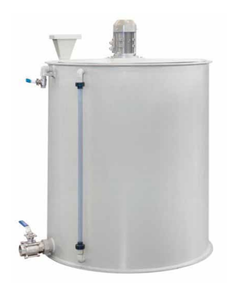
Manual polymer station